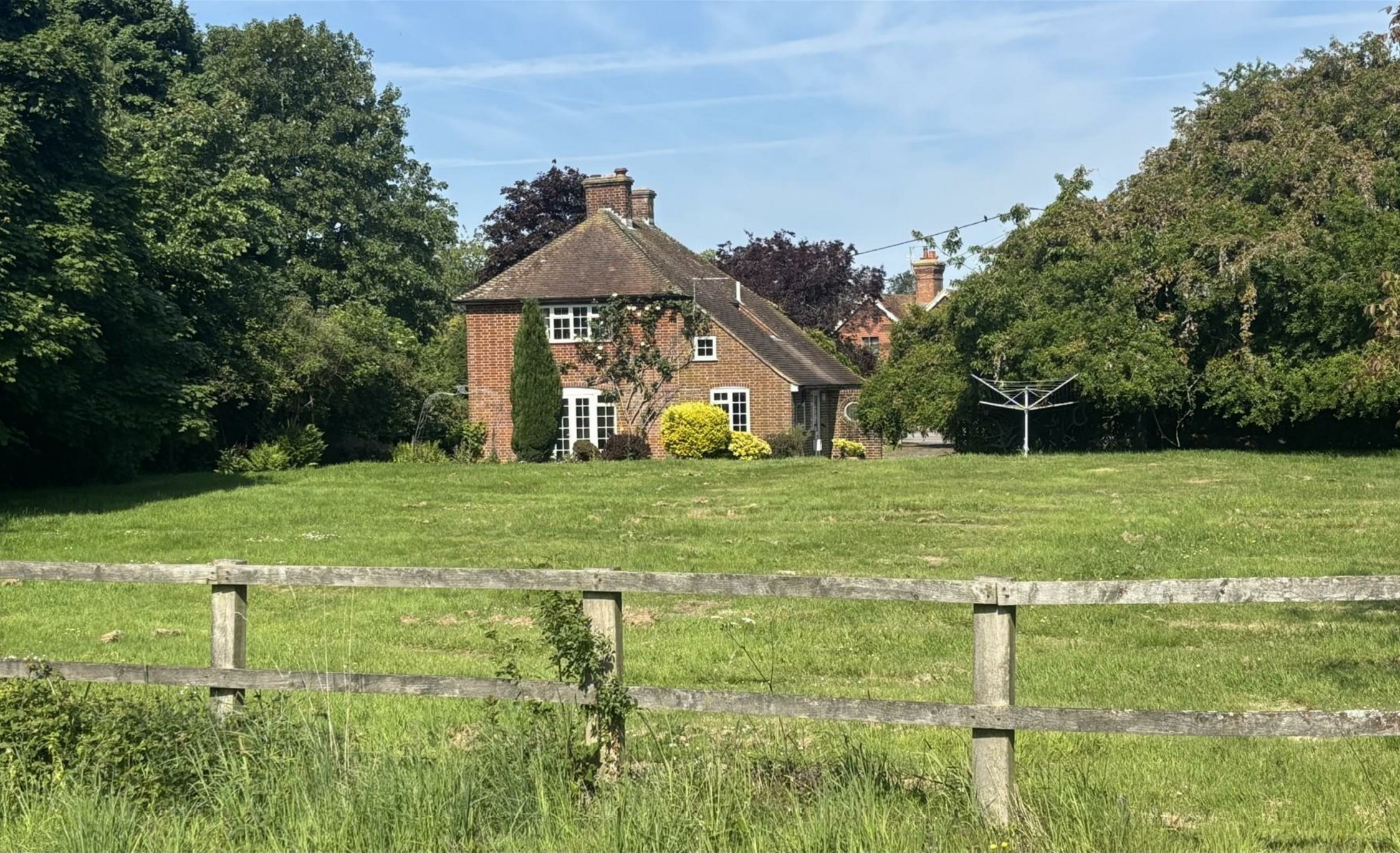
Church Farm, Church Lane, Ripe, Lewes, BN8 6AU